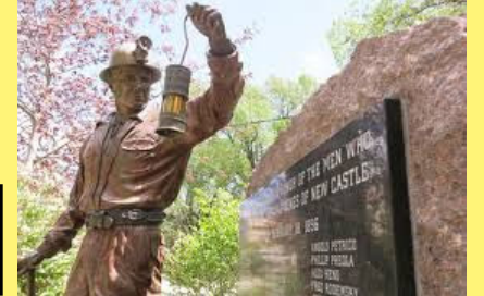
Top to bottom: Indiana, Philadelphia, Oklahoma, Washington State, Colorado

In 1998 the Mayor of Shinshiro in Japan took the initiative to invite representatives of seven "Newcastles" to his city. They have continued to meet every two years – in Neuchâtel, Switzerland in 2000, USA (Indiana/Pennsylvania) in 2002, South Africa 2004 & 2010, Newcastle-under-Lyme (UK) in 2006, Neuburg an der Donau, Germany in 2008, Newcastle upon Tyne (UK) in 2012 and most recently Nové Hradý in the Czech Republic in 2014.