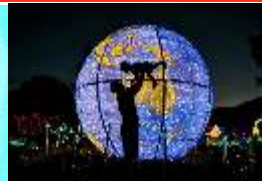
Some "Newcastle" Christmas photos to bring a smile - left Newcastle, Australia; further left New Castle Pennsylvania; Newcastle, Ontario; Nyborg, Denmark; right Newcastle upon Tyne UK